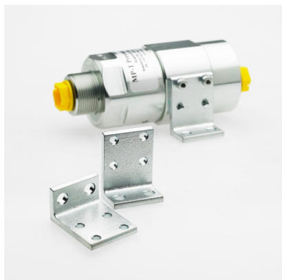
Mounting brackets for base plate

The MP-T pressure intensifier can be mounted using a standard pipe clamp. The accessories below for clamping and connecting the intensifier are available.