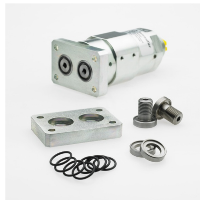
Connection kit for block mounting