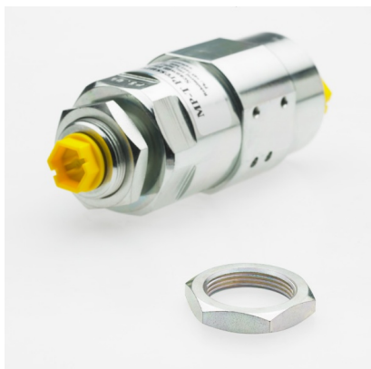
Nut M28 x 1.5 for fixation