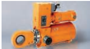
Pressure Intensifiers Single-Stroke Type