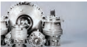
Planetary Gear Box