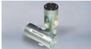
Regeneration Valves Speed Valve