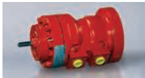
Rotary Actuators Specialty-Custom