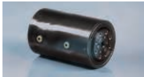
Rotary Actuators Standard