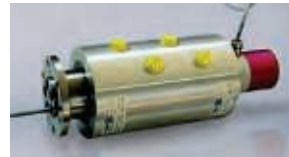
Rotary Unions Electrical Slip Ring