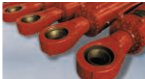
Hydraulic Cylinders Custom