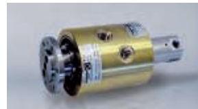
Rotary Unions Simple to Complex