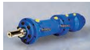
Rotary Actuators Linear-Rotary