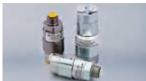
Pressure Intensifiers In-Line Reciprocating Type