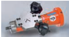
Hydraulic Cylinders Test Cylinders