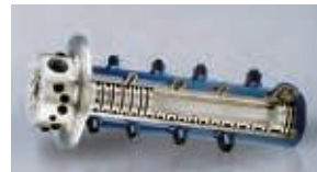
Rotary Unions Custom