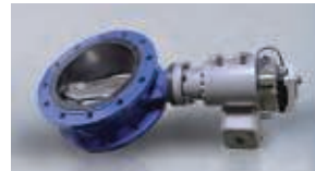
Valve Actuators Self-Contained