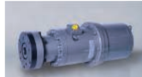
Valve Actuators Spring Return