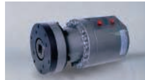
Valve Actuators Double-Acting