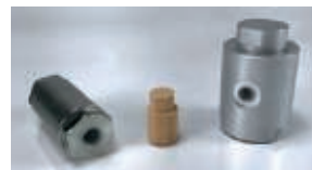
High Pressure Filters