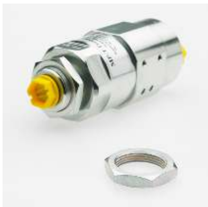
Nut M28 x 1.5 for fixation