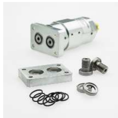
Connection kit for block mounting