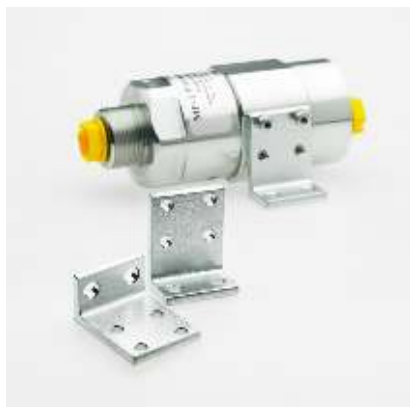
Mounting brackets for base plate

The MP-T pressure intensifier can be mounted using a standard pipe clamp. The accessories below for clamping and connecting the intensifier are available.